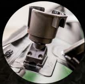
Cup Holder Mounts